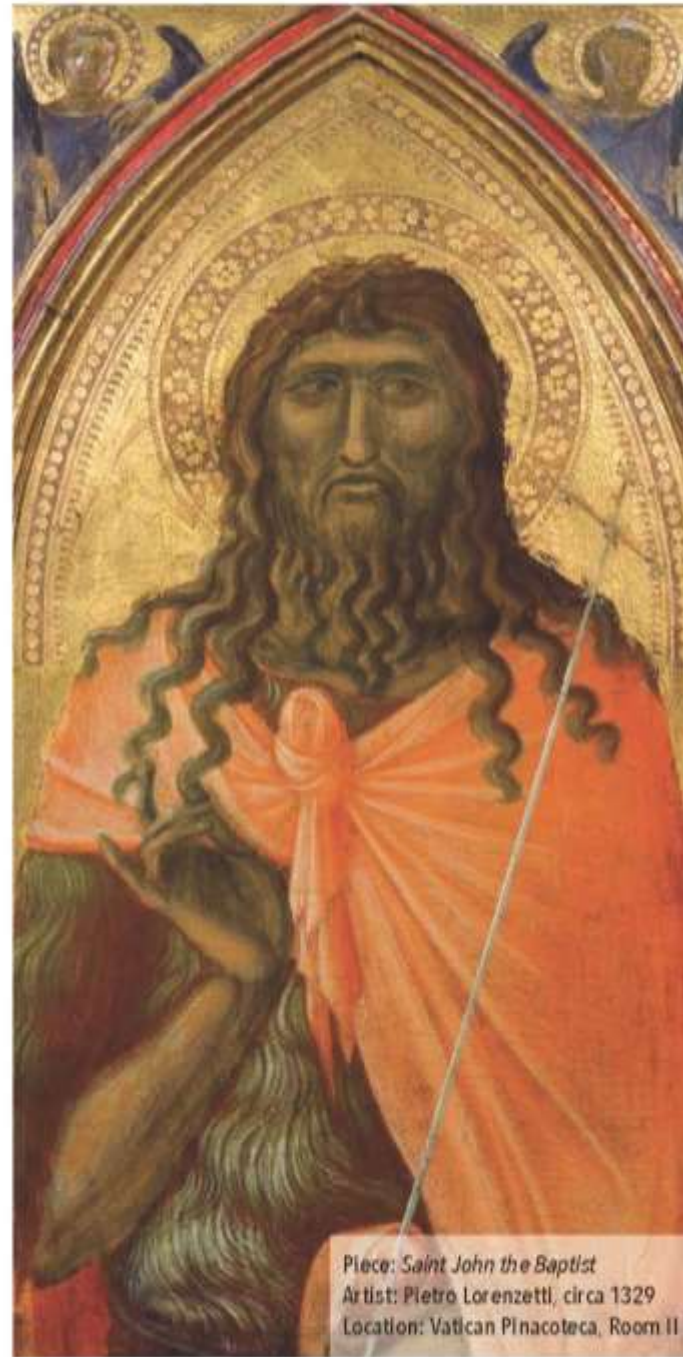
Piece: Saint John the Baptist Artist: Pietro Lorenzetti, circa 1329 Location: Vatican Pinacoteca, Room II