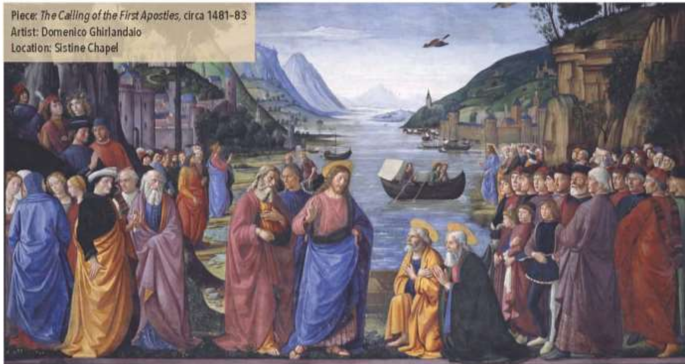
Piece: The Calling of the First Apostles , circa 1481–83 Artist: Domenico Ghirlandaio Location: Sistine Chapel

January 22, 2017 Third Sunday in Ordinary Time (A) Is 8:23—9:3 1 Cor 1:10—13, 17 Mt 4:12—23 or 4:12—17