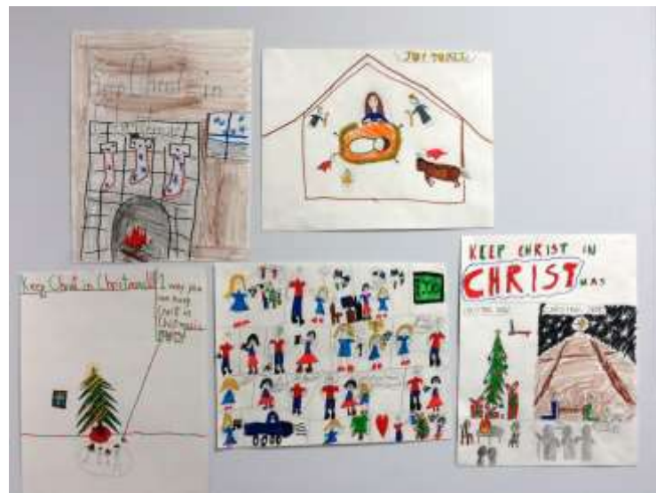
4TH & 5TH

The Council presented cash awards to 1st, 2nd & 3rd place for 5-7 and 8-10 year old age groups.