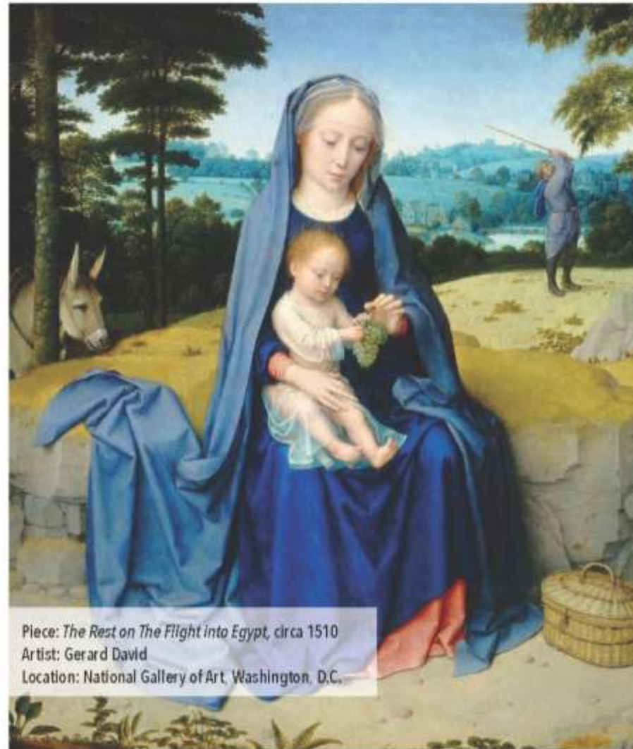
Piece: The Rest on The Flight into Egypt , circa 1510 Artist: Gerard David Location: National Gallery of Art, Washington, D.C.

God loves us so much, like a mother loves her child. He provides for all his creatures, even for the lily that only blooms for a day. He knows everything