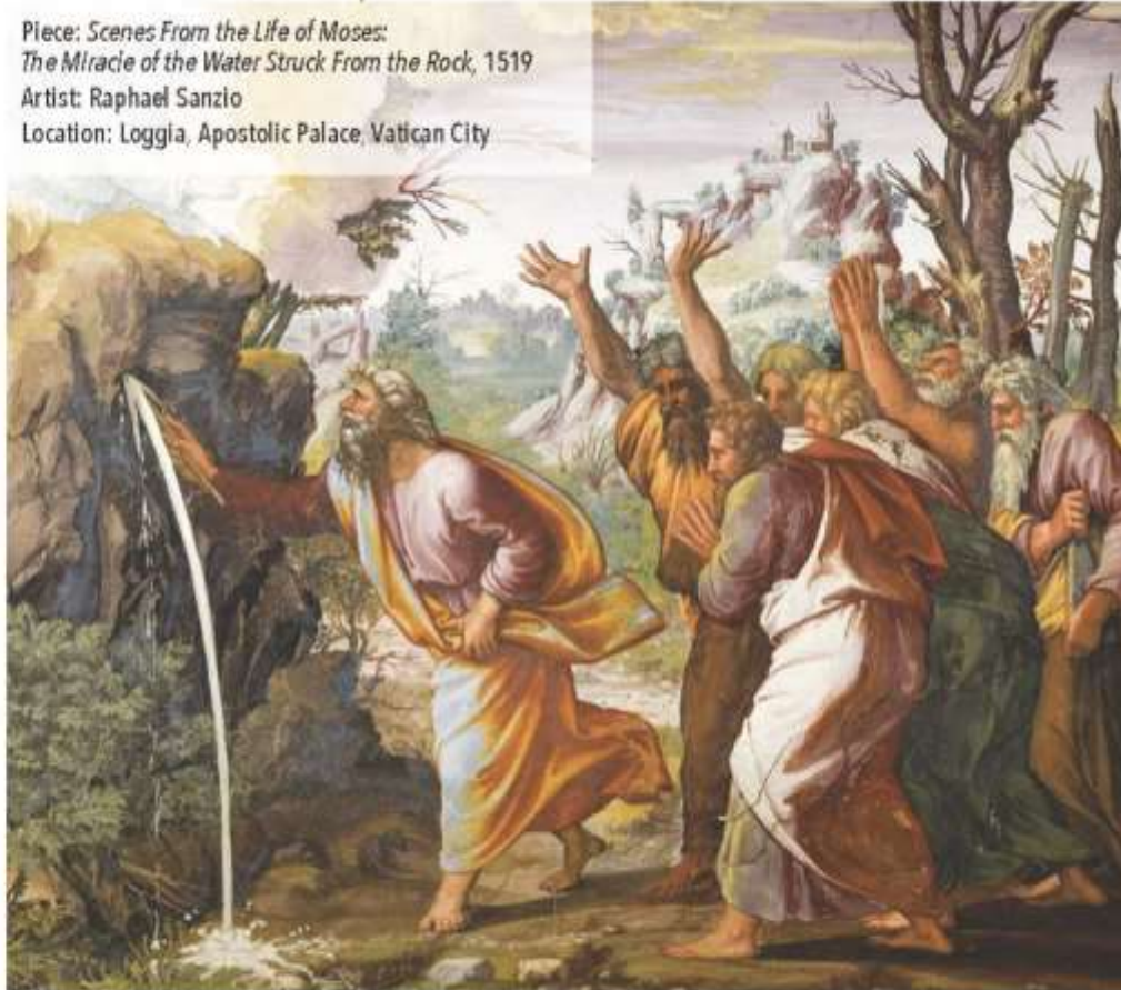
Piece: Scenes From the Life of Moses: The Miracle of the Water Struck From the Rock , 1519 Artist: Raphael Sanzio Location: Loggia, Apostolic Palace, Vatican City