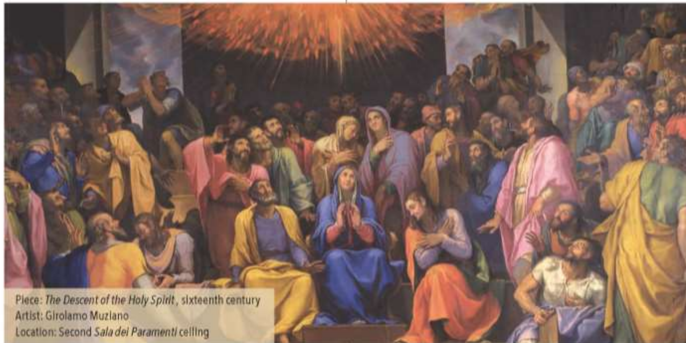
Piece: The Descent of the Holy Spirit , sixteenth century Artist: Girolamo Muziano Location: Second Sala dei Paramenti ceiling

For Reflection How can I encourage greater unity within my family and parish? Is there a way I can be more of a team player?