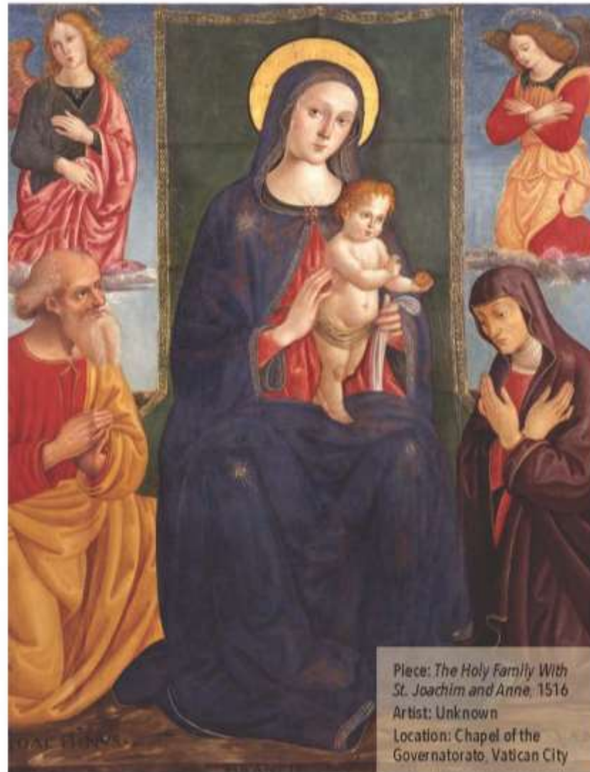
Piece: The Holy Family With St. Joachim and Anne, 1516 Artist: Unknown Location: Chapel of the Governatorato, Vatican City

Thirteenth Sunday in Ordinary Time (A) 2 Kgs 4:8-11, 14-16a Rom 6:3-4, 8-11 Mt 10:37-42