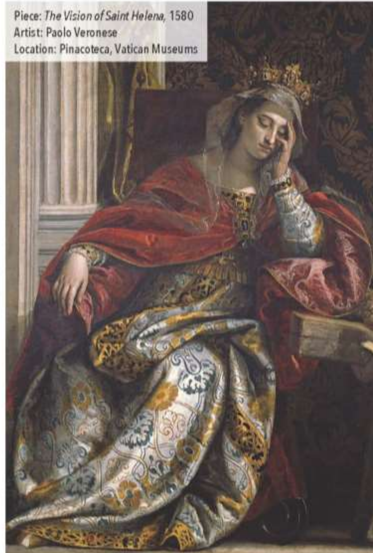
Piece: The Vision of Saint Helena , 1580 Artist: Paolo Veronese Location: Pinacoteca, Vatican Museums