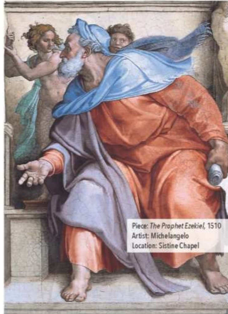
Piece: The Prophet Ezekiel , 1510 Artist: Michelangelo Location: Sistine Chapel