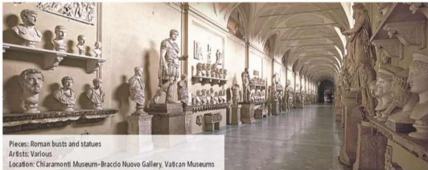
Pieces: Roman busts and statues Artists: Various Location: Chiamonti Museum-Braccio Nuovo Gallery, Vatican Museums

Do I render to God what he deserves for all he has given me?