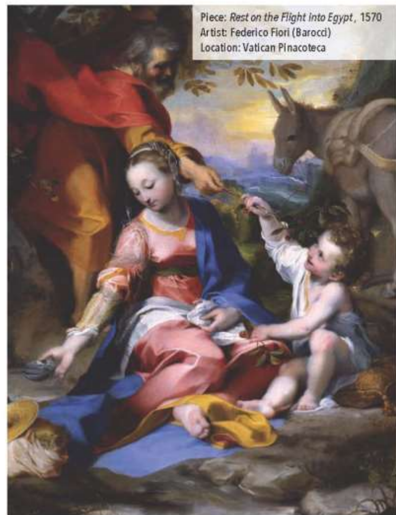
Piece: Rest on the Flight into Egypt , 1570 Artist: Federico Fiori (Barocci) Location: Vatican Pinacoteca

Federico Barocci captured the Holy Family escaping to Egypt. Although they are refugees in a dramatic, stressful situation, he chooses to show the delightful communion among them. Mary sits comfortably in the center of the family, busily