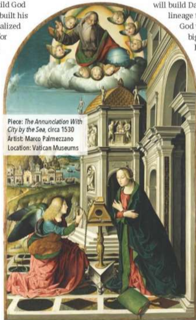
Piece: The Annunciation With City by the Sea , circa 1530 Artist: Marco Palmezzano Location: Vatican Museums

God turns the tables on David, saying that God