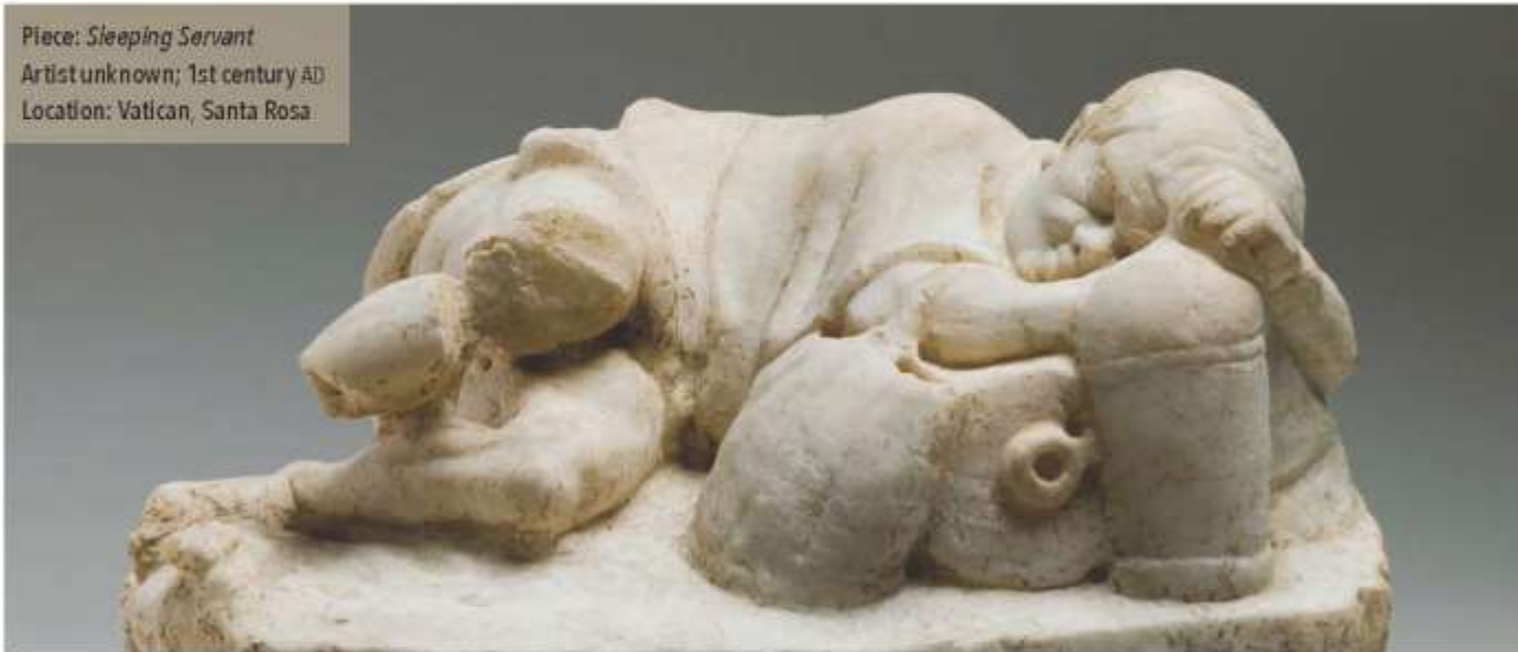
Piece: Sleeping Servant Artist unknown; 1st century AD Location: Vatican, Santa Rosa