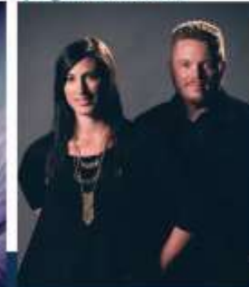
Out of Darkness