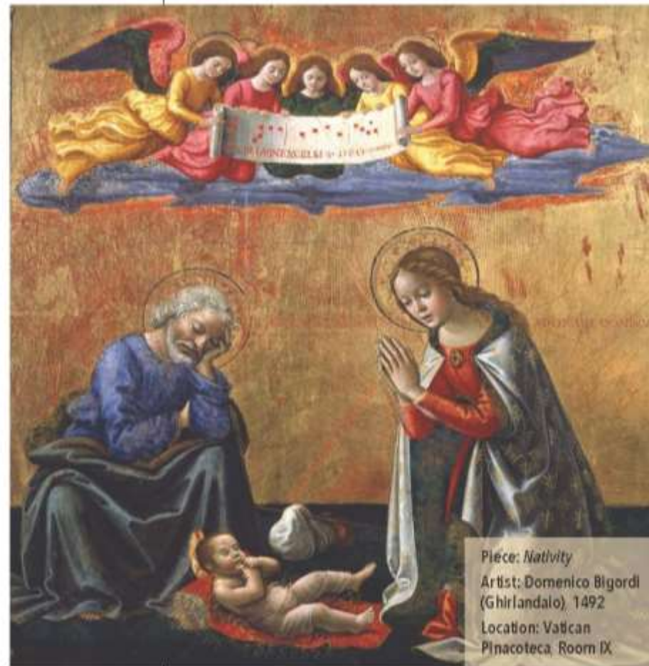
Piece: Nativity Artist: Domenico Ghirlandaio (Ghirlandaio), 1492 Location: Vatican Pinacoteca, Room IX