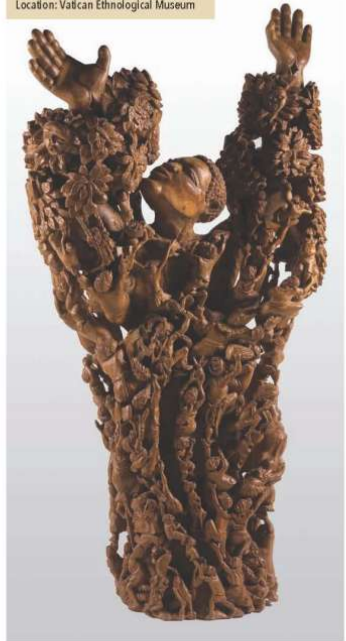
Piece: The Tree of Life Artist and date unknown Location: Vatican Ethnological Museum

"Jacob the father of Joseph, the husband of Mary. Of her was born Jesus who is called the Messiah (Matthew 1:16).