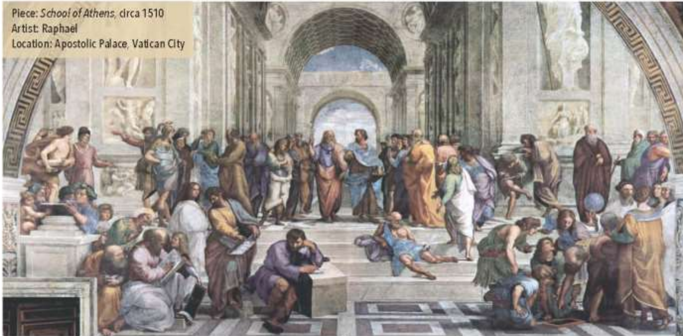
Piece: School of Athens , circa 1510 Artist: Raphael Location: Apostolic Palace, Vatican City

Fifth Sunday in Ordinary Time (A) Is 58:7-10 1 Cor 2:1-5 Mt 5:13-16