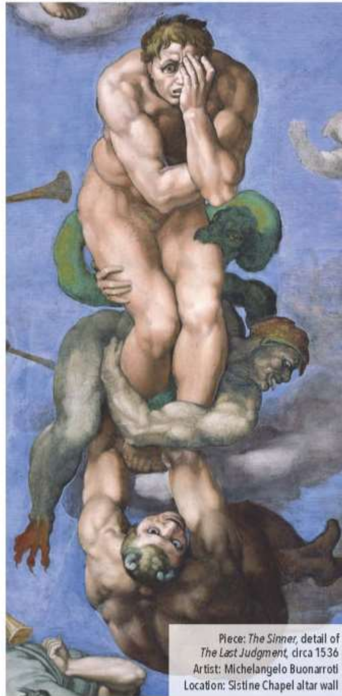
Piece: The Sinner , detail of The Last Judgment , circa 1536 Artist: Michelangelo Buonarroti Location: Sistine Chapel altar wall

"You shall not hate any of your kindred in your heart.... Take no revenge and cherish no grudge against your own people. You shall love your neighbor as yourself" (Leviticus 19:17-18).