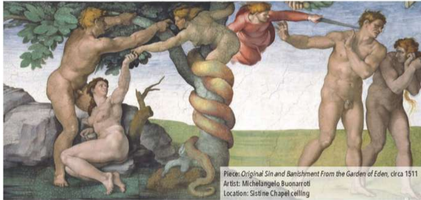
Piece: Original Sin and Banishment From the Garden of Eden , circa 1511 Artist: Michelangelo Buonarroti Location: Sistine Chapel ceiling

March 5, 2017 First Sunday of Lent (A) Gn 2:7-9; 3:1-7 Rom 5:12-19 Mt 4:1-11