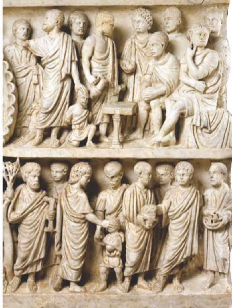
Piece: Dogmatic Sarcophagus , healing of the blind man, circa 325-350 Artist: Unknown Location: Vatican Museums