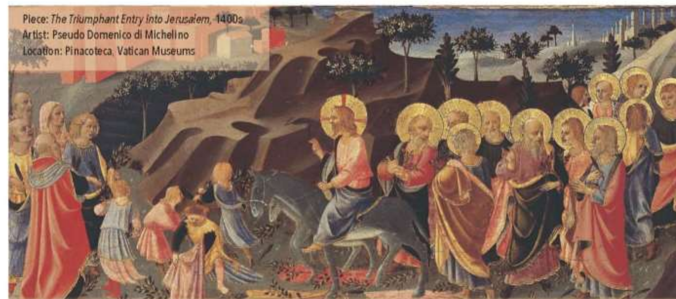
Piece: The Triumphant Entry into Jerusalem , 1400s Artist: Pseudo Domenico di Michelino Location: Pinacoteca, Vatican Museums

For Reflection How do I respond to Jesus' invitation to join him in his passion? How do my actions indicate where my heart really is? Would I be shrouded in shadow or surrounded by Jesus' glory?