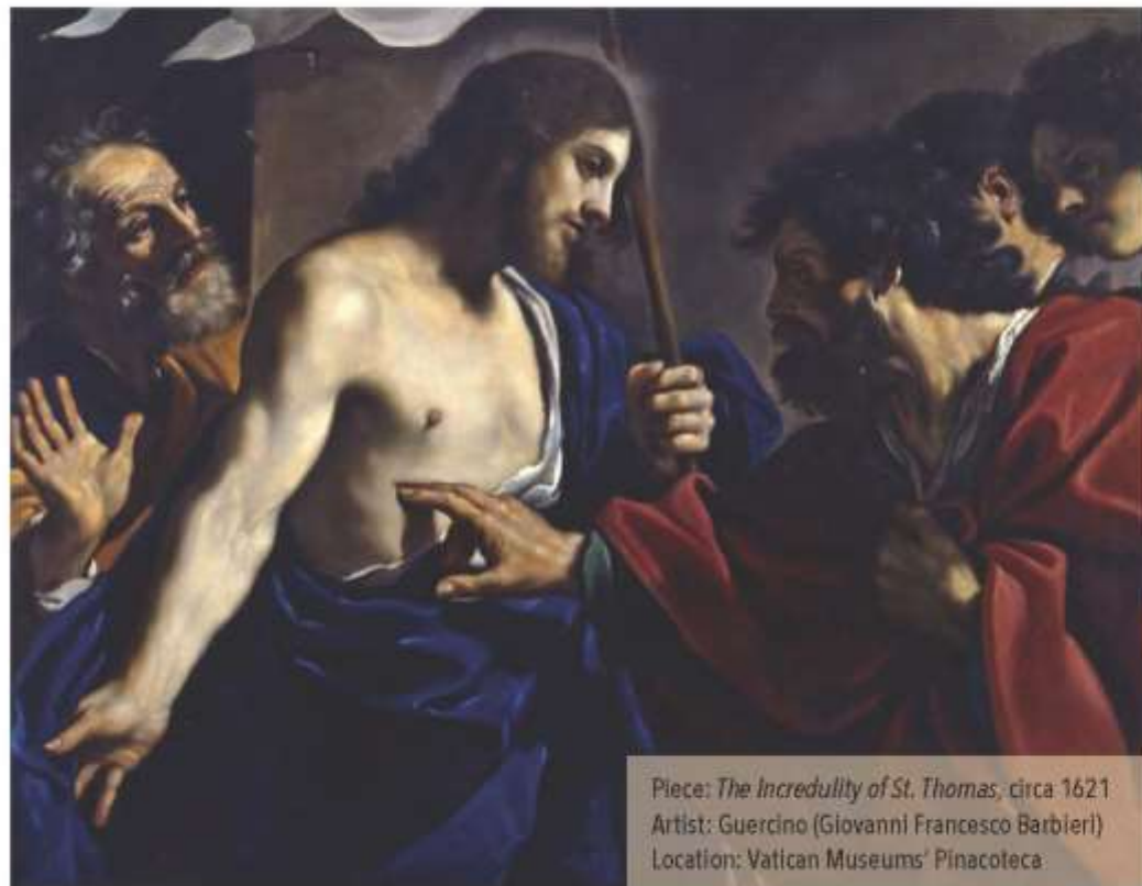
Piece: The Incredulity of St. Thomas ; circa 1621 Artist: Guercino (Giovanni Francesco Barbieri) Location: Vatican Museums' Pinacoteca