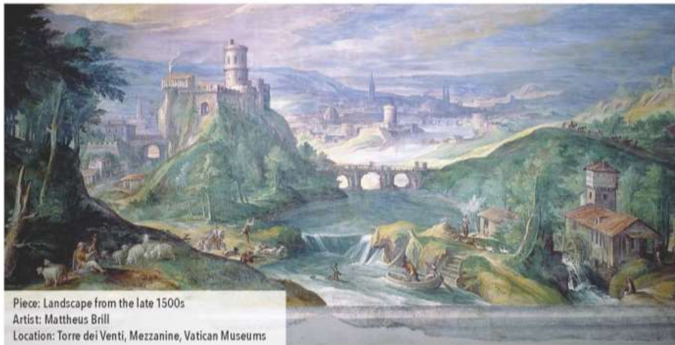
Piece: Landscape from the late 1500s Artist: Mattheus Brill Location: Torre dei Venti, Mezzanine, Vatican Museums

How does our Lord want to see fruit and growth in your life? Have I squandered God's harvest in my life?