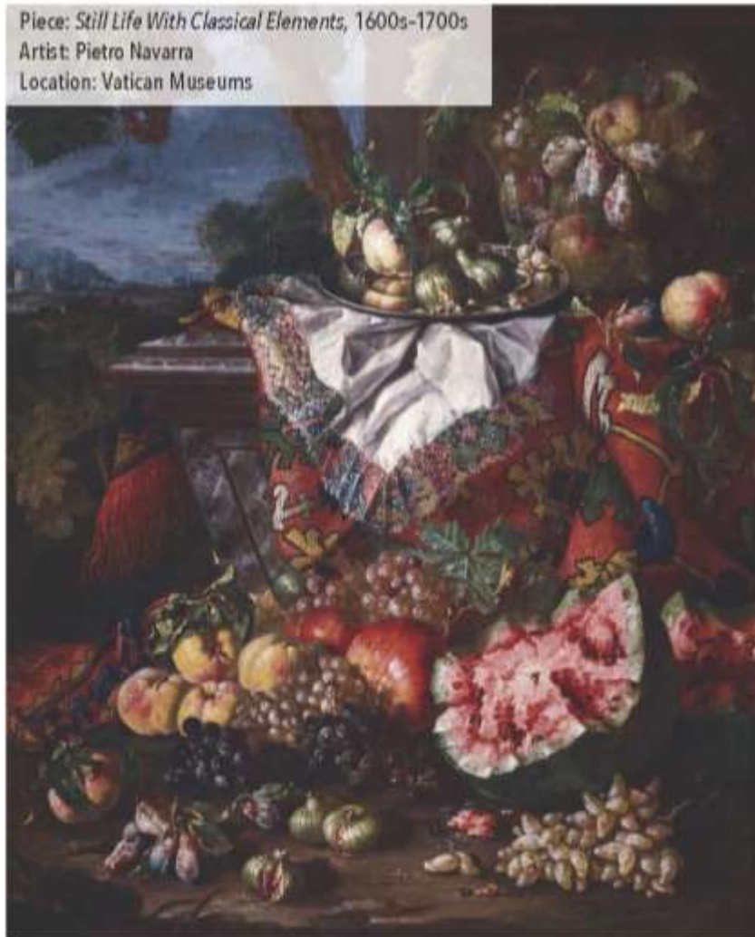
Piece: Still Life With Classical Elements , 1600s-1700s Artist: Pietro Navarra Location: Vatican Museums