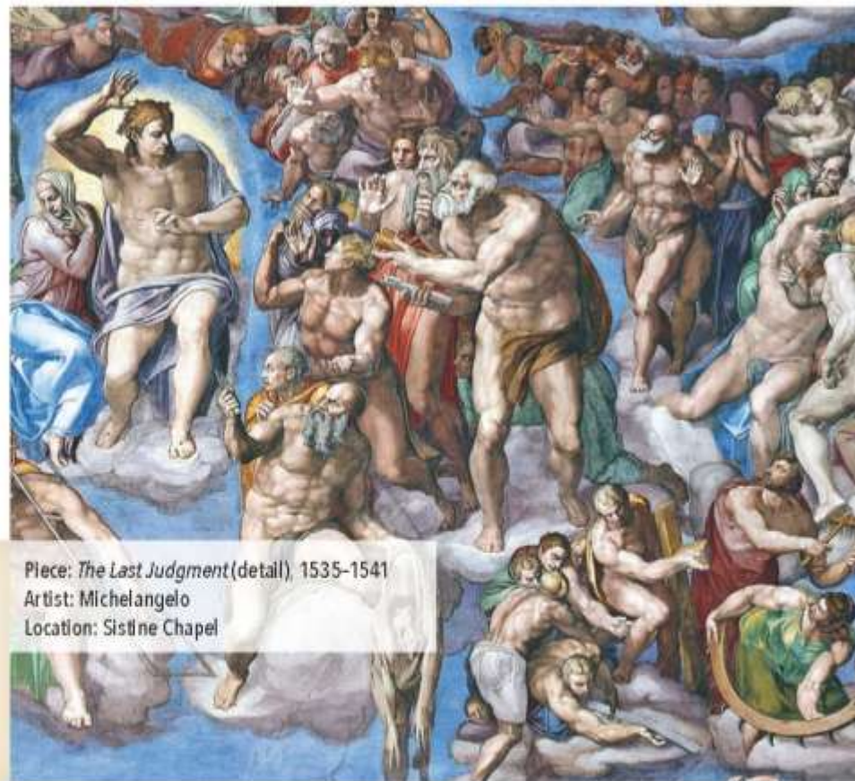
Piece: The Last Judgment (detail), 1535-1541 Artist: Michelangelo Location: Sistine Chapel